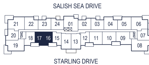
LEVELS 2 + 3 + 4