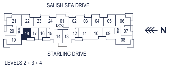
LEVELS 2 + 3 + 4