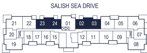
LEVELS 1 + 2