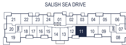
LEVELS 3 + 4